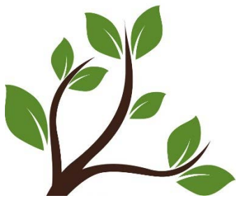
The Leaves – brings new $$ to community