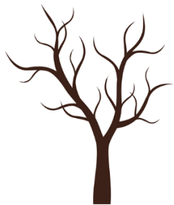
The Branches – supports and is supported by local businesses